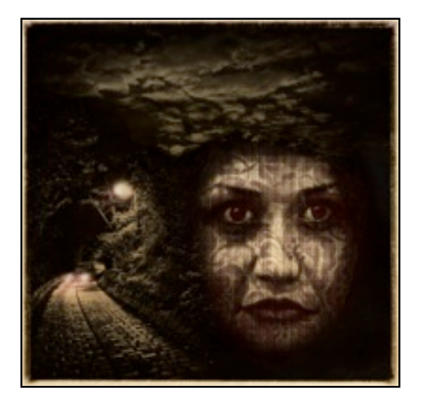
That Dame Has Made Her Last Veiled Threat